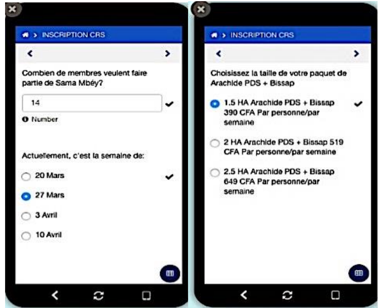
Screenshots from mobile enrollment app